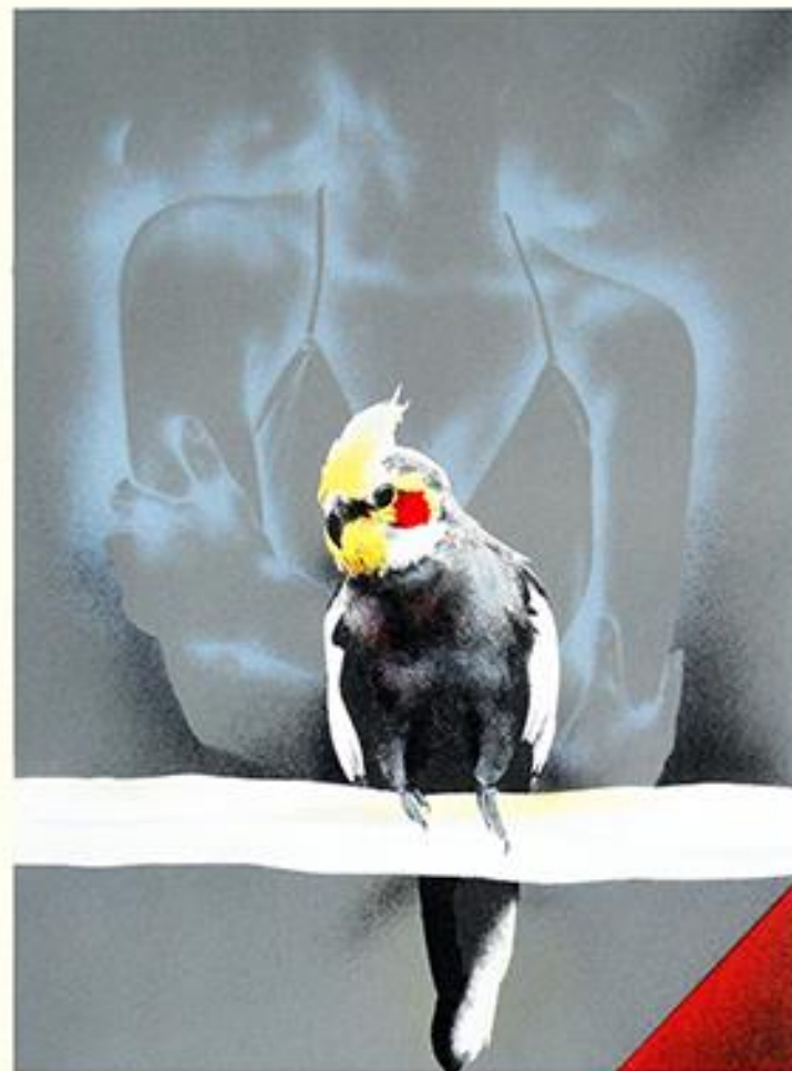
19 Cockatiel ( Nymphicus hollandicus ) by Hideo Yoshihara, lithograph, 320 x 450