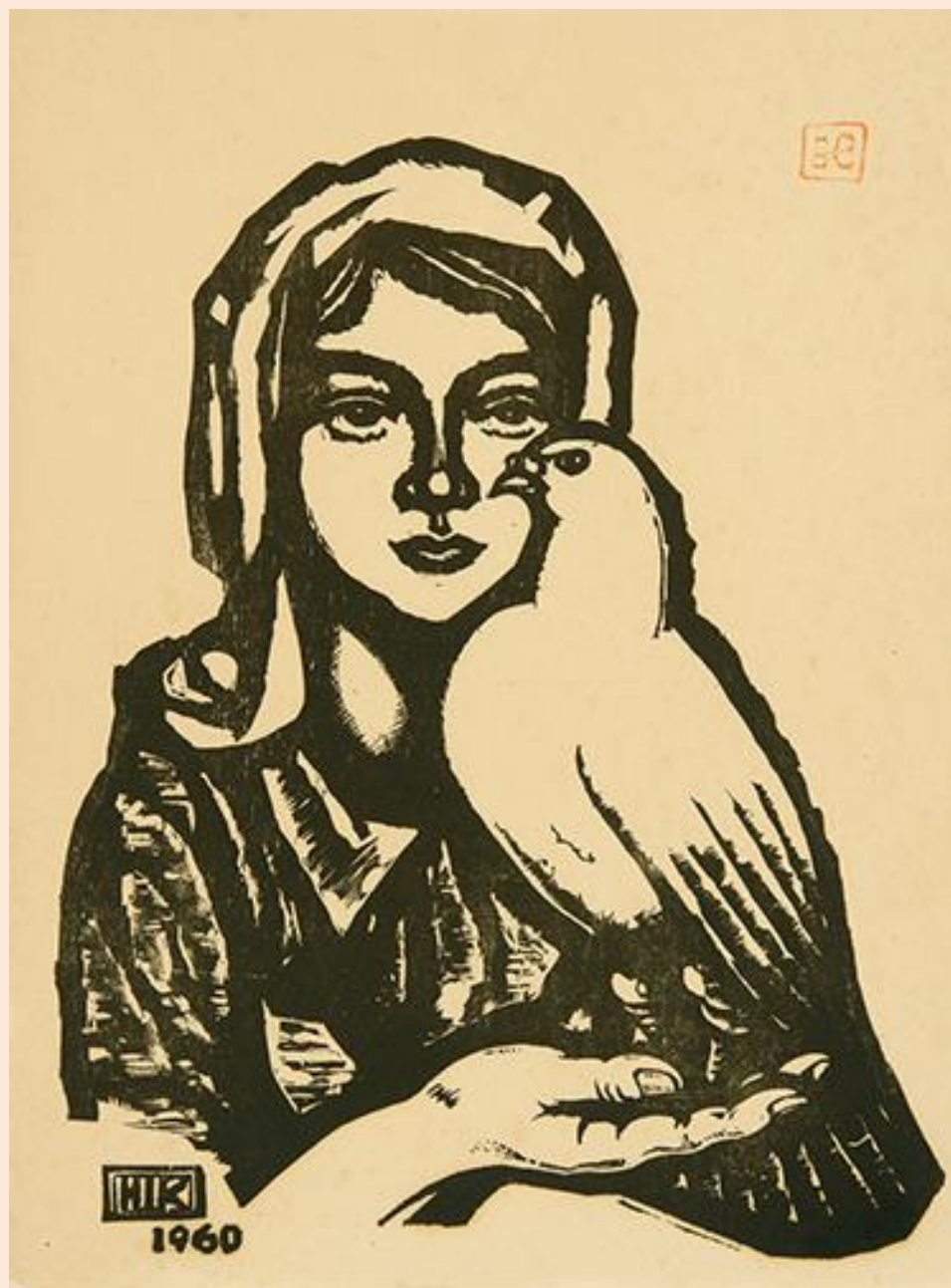
13 Rock dove ( Columba livia ) by Koji Shini, woodblock print, 245 x 325 mm