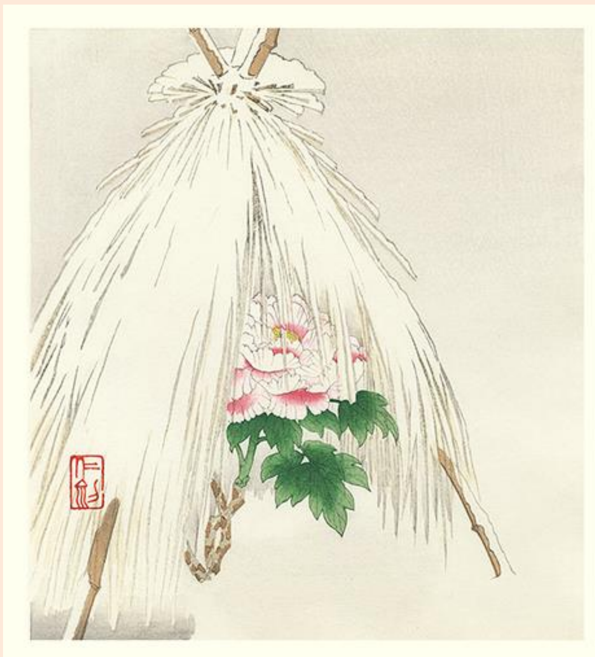
1 Tree peony ( Paeonia suffruticosa ) by Nisaburō Itō, woodblock print, 280 x 290 mm